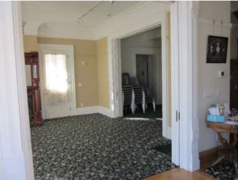
View from the front door: